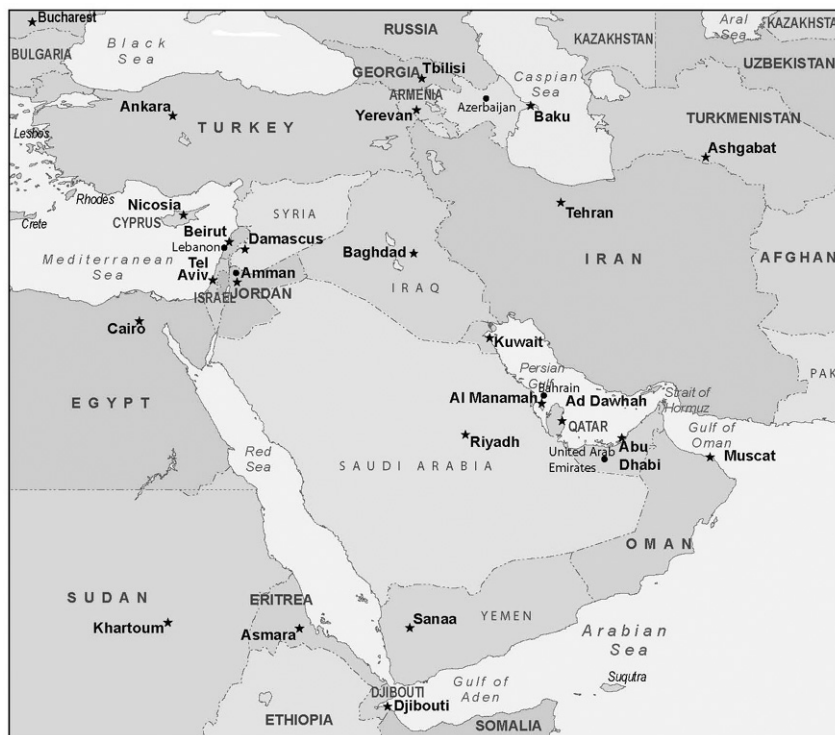
MAP OF THE MIDDLE EAST