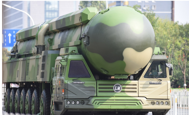
DF-41 road mobile ICBM. China continues to field its first road-mobile ICBM with MIRV capability. This system likely has improved range and accuracy over DF-31 class ICBMs.