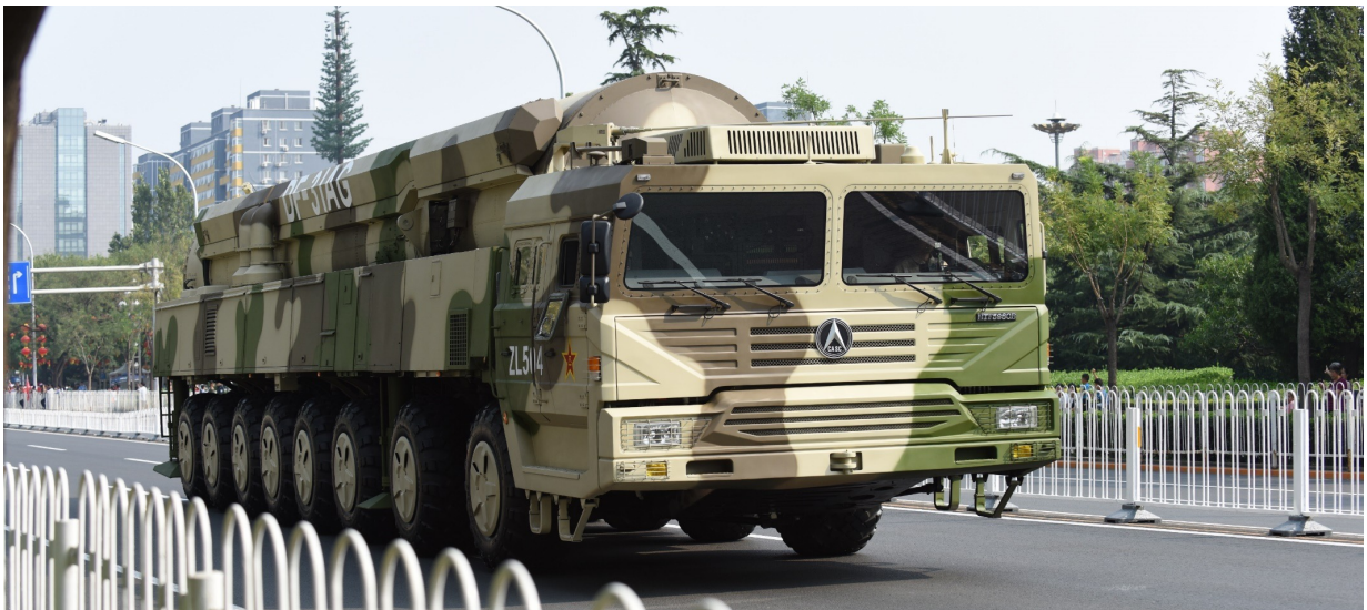
DF-31AG Road Mobile ICBM. China is fielding DF-31 class TEL-based road mobile ICBMs that likely have improved survivability and lethality over previous versions.