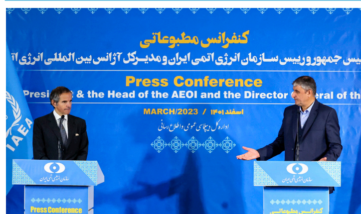
4 March 2023 – Director General Rossi of the AIEA and Eslami, head of the Atomic Energy Organization of Iran.

the PHRC was consolidated under the “Amad Plan,” which was essentially Iran's coordinated and comprehensive effort to develop a nuclear weapon. 298 However, in late 2003, Ayatollah Ali Khamenei declared that Iran is “against any production of weapons of mass destruction in any form,” and Iran halted its nuclear weapons program. This action was primarily in response to increasing international scrutiny and pressure resulting from the exposure of Iran's previously undeclared nuclear work and Operation ENDURING FREEDOM in Afghanistan and Operation IRAQI FREEDOM in Iraq. 299,300 After the halt, Iran continued its efforts to develop uranium enrichment technology, which it first declared to the IAEA in early 2003, when it stated it was constructing two uranium enrichment facilities at Natanz. 301 Iran also constructed an uranium enrichment facility near the city of Qom, where it began enriching uranium to near-20-percent levels in mid-2011. 302,303,304