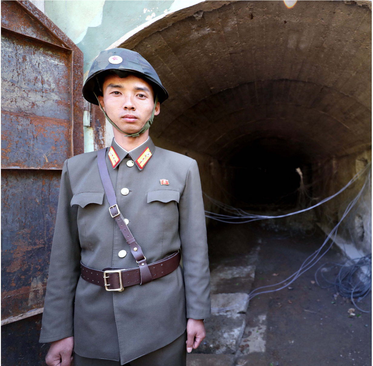
The entrance to a tunnel at the Punggye-Ri nuclear test site prior to the May 2018 demolition ceremony.

expressed the need to rapidly modernize its nuclear forces at the “fastest possible speed.” 277